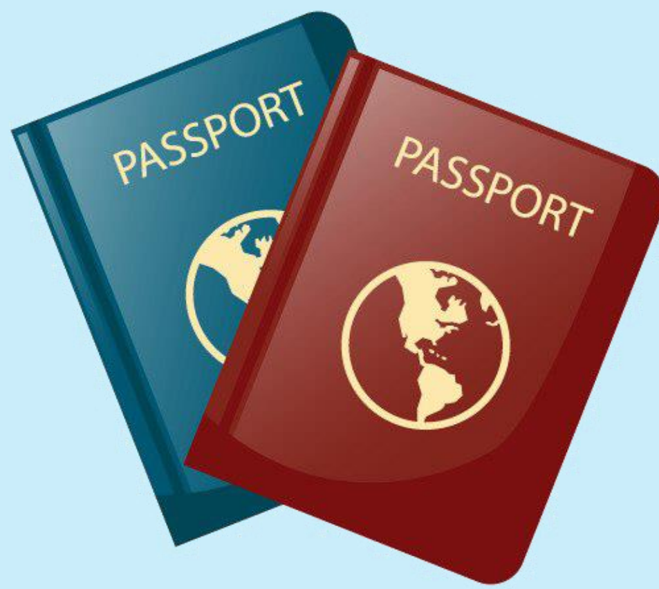
(2) Original Passport